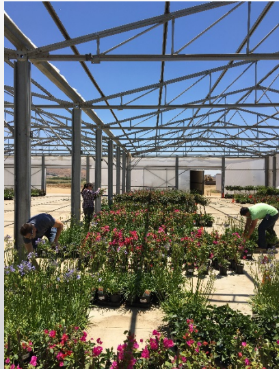
RIVERSIDE COUNTY AGRICULTURAL PRODUCTION REPORT 2014